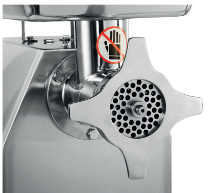
Knives and plates made of hardened steel