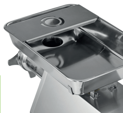
Housing and tray made of stainless steel