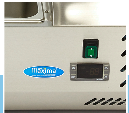
Dixell digital temperature controller