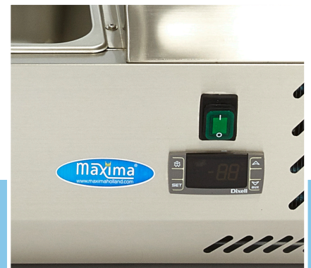
Dixell digital temperature controller