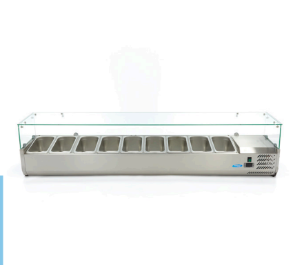
Stainless steel housing with capacity of 8 x 1/3 GN