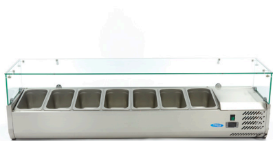
Stainless steel housing with capacity of 7 x 1/3 GN