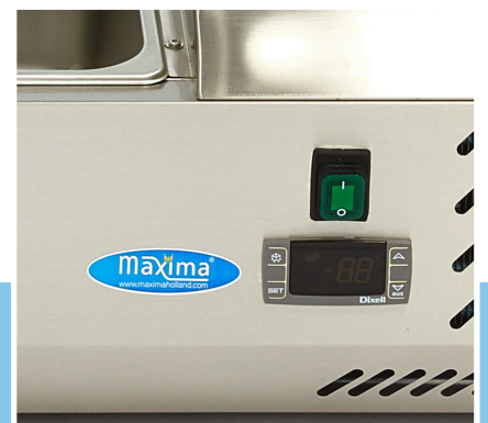
Dixell digital temperature controller