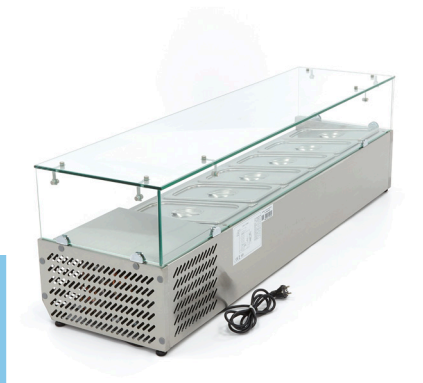
Static cooling with foamed evaporator