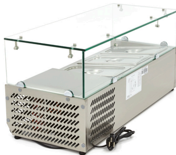
Static cooling with foamed evaporator