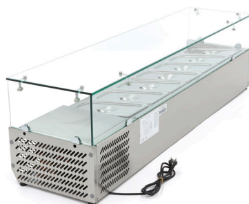
Static cooling with foamed evaporator