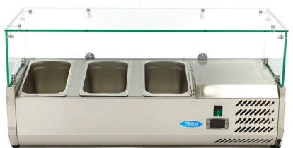
Stainless steel housing with capacity of 3 x 1/3 GN