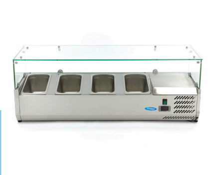
Stainless steel housing with capacity of 4 x 1/3 GN or 3 x 1/3 + 1/2 GN