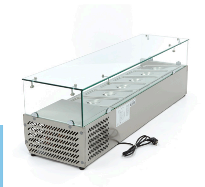
Static cooling with foamed evaporator