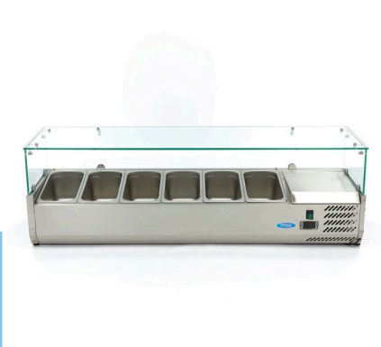
Stainless steel housing with capacity of 6 x 1/3 GN