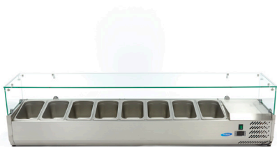
Stainless steel housing with capacity of 8 x 1/3 GN