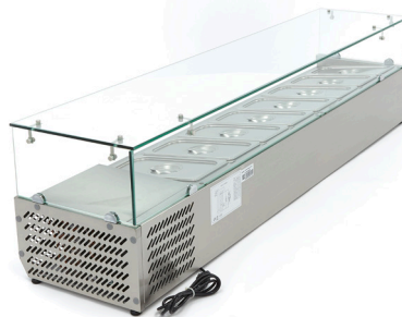
Static cooling with foamed evaporator