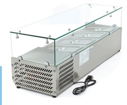
Static cooling with foamed evaporator