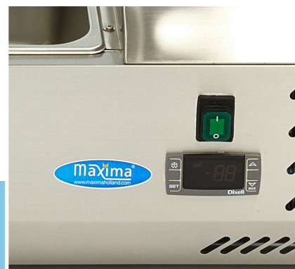
Dixell digital temperature controller