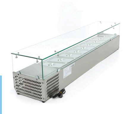
Static cooling with foamed evaporator