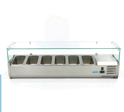
Stainless steel housing with capacity of 6 x 1/3 GN or 5 x 1/3 + 1/2 GN