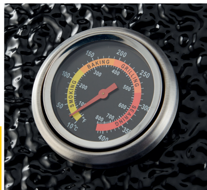
Thermometer with a temperature scale for Celsius and Fahrenheit