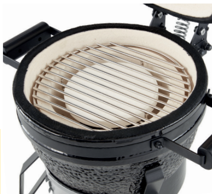
Equipped with ceramic sides and fire bowl