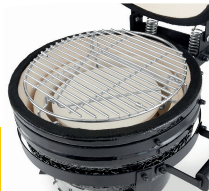
Equipped with ceramic sides and fire bowl