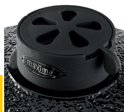
With sturdy cast iron chimney