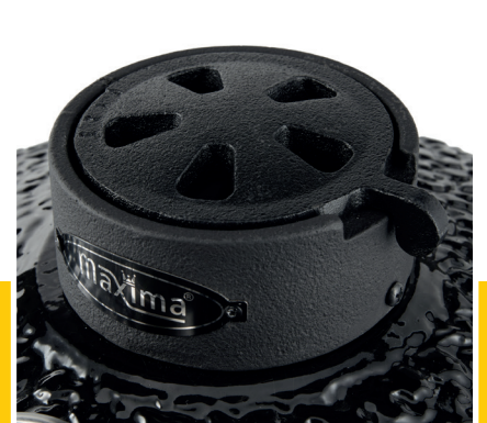
With sturdy cast iron chimney