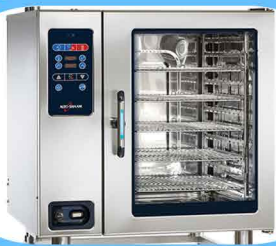
STEAM COMBI OVENS